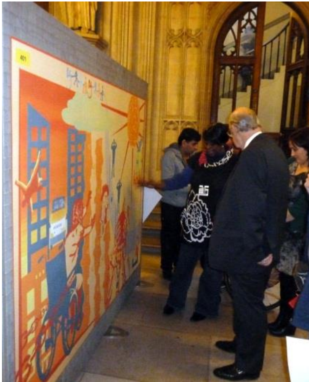
Figure 8: The exhibition at the Houses of Parliament.

The public nature of the artwork enabled key messages to be promoted in an accessible and innovative way. A portable exhibition was also created for use with more targeted audiences such as policy makers, service providers or community groups (see figure 8 below).