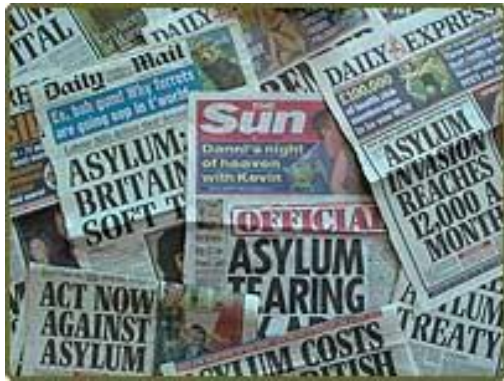
Figure 2: Media reporting of asylum (BBC, 2003)

included: 'Army on alert at French ports to stop migrant invasion' (Sunday Express, 2014); 'Patients lose GP surgery to asylum seekers' (Daily Mail, 2014).