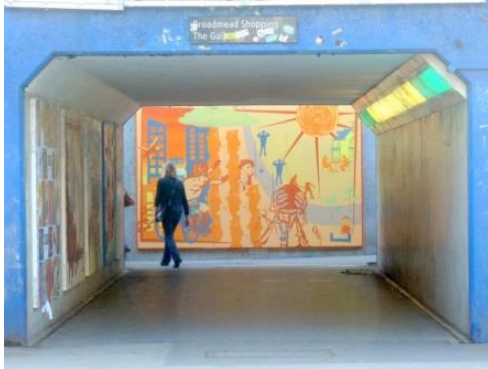
Figures 4 and 5: the mural