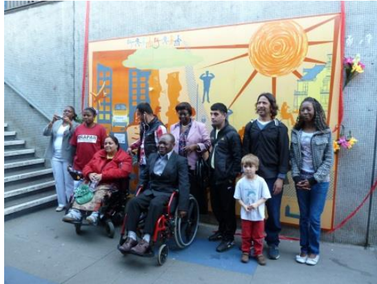
Figures 6 and 7: participants and friends

The public nature of the artwork enabled key messages to be promoted in an accessible and innovative way. A portable exhibition was also created for use with more targeted audiences such as policy makers, service providers or community groups (see figure 8 below).