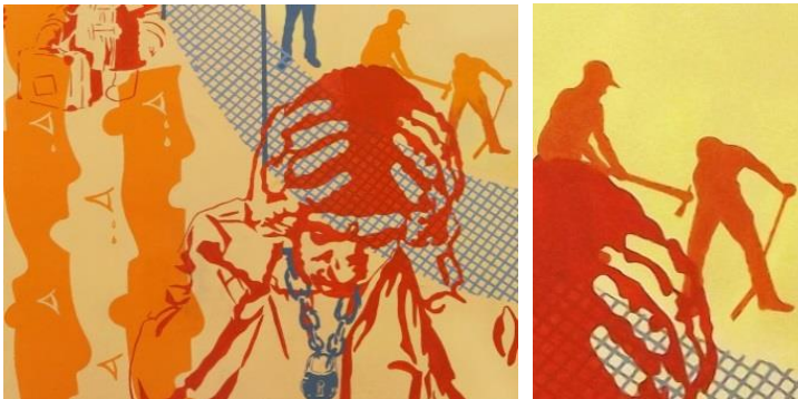
Figure 9: The mural shows a montage of faces watching two people working on the other side of the fence

Disabled asylum seekers described the denial of the right to work as a key division between themselves and UK citizens.